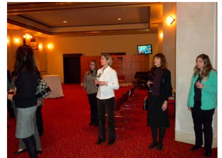
Learning about all of the events that take place at the Marcus Center.