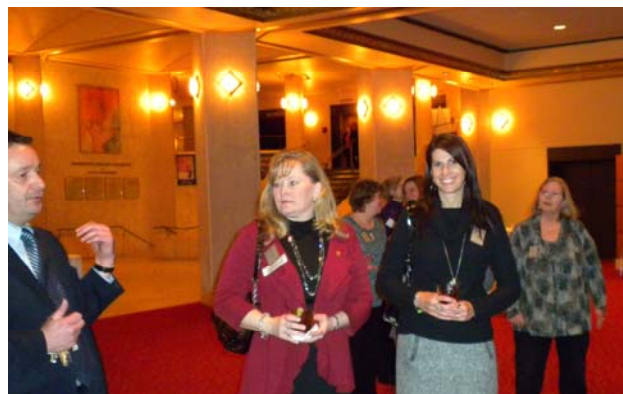
Guided tours of the Marcus Center for the Performing Arts.