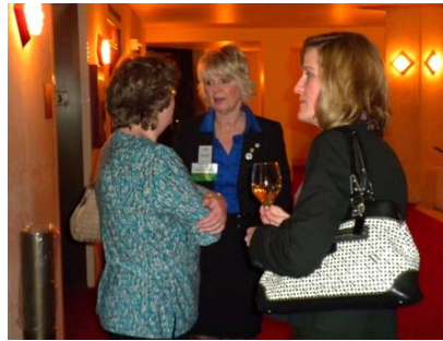
Making Connections at the January 10, 2012 EWI Membership Meeting at the Marcus Center for the Performing Arts.